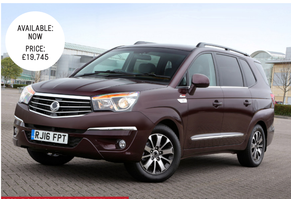
PEOPLE CARRIER NOW EVEN BETTER VALUE