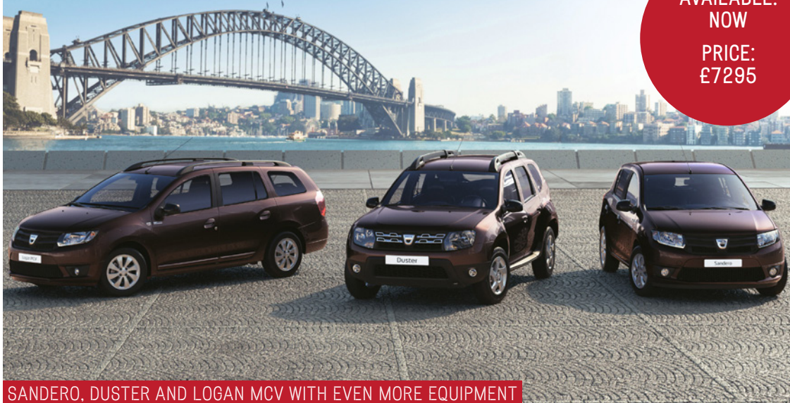
SANDERO, DUSTER AND LOGAN MCV WITH EVEN MORE EQUIPMENT

Building on the popular Ambience specification, the new special edition includes additional exterior equipment that when bought collectively adds up to £1,190 – all for a price premium of only £500 over the Ambience trim. They have unique 'Chestnut' metallic paint, alloy wheels and, on the Sander and Logan MCV, front fog lights. So there we have Dacia offering even more value for money with a groovy colour and funky alloys.