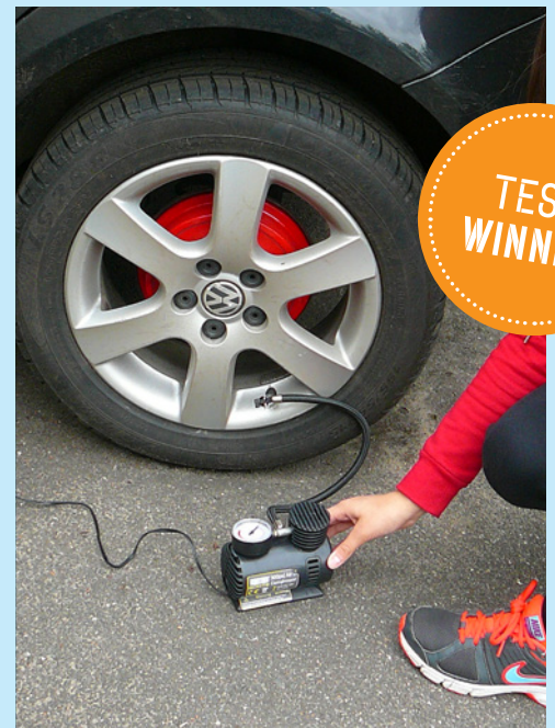
12V PLUG IN COMPRESSOR £4.99