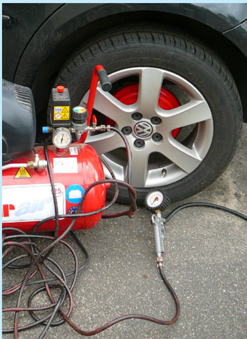
CLARKE SHHH AIR 100/24 £718.80

Like all good drivers I like to make sure that my tyres are properly inflated and I can do that in a number of ways and that's what this test is all about. What I have decided to do is compare different methods of pumping a tyre up. Some are manual and hard work, others you can plug into the car battery from the socket and others need to be attached to the mains. There's also a bit of a price difference as one is jolly expensive. So is there really a winner here, or just a different and possibly costly way of pumping up a tyre?