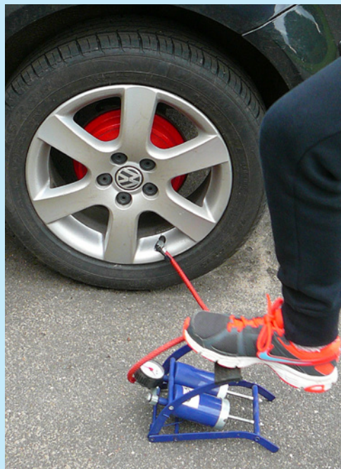
FOOT PUMP ROLSON DOUBLE CYLINDER FOOTPUMP £5.99