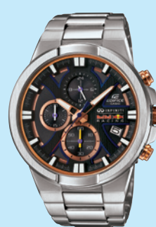
EDIFICE EFR-544RB Stainless steel case and metal strap, water resistant to 100m, stopwatch accurate to 1/10th second, date function. RRP £175