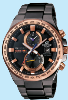
EDIFICE EFR-542RBM Ion-plated stainless steel case and strap, water resistant to 10bar pressure, stopwatch accurate to 1/20th second, countdown timer, day and date calendar, and world time in 29 cities. RRP £330