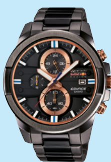
EDIFICE EFR-543RBM Ion-plated stainless steel case and metal strap, water resistant to 100m, stopwatch accurate to 1/10th second, date function. RRP £200