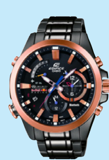
EDIFICE EQB-510RBM Ion-plated stainless steel case and strap, sapphire glass, water resistant to 10bar pressure, Bluetooth smartphone link, solar-powered battery, split-function stopwatch, automatic calendar, dual world time, speed meter. RRP £550