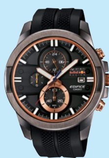
EDIFICE EFR-543RBP Ion-plated stainless steel case, black resin strap, water resistant to 100m, stopwatch accurate to 1/10th second, date function. RRP £175