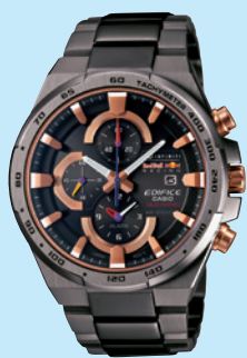
EDIFICE EFR-541SBRB-1A Ion-plated stainless steel case and strap, sapphire glass, water resistant to 10bar pressure, thermometer, solar-powered battery and tachymeter. RRP £390