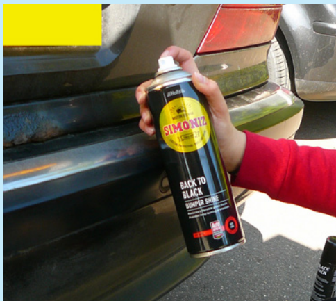
SIMONIZ BACK TO BLACK 500ML £4.99 FROM WILKINSONS

Incredibly this was the cheapest, however Black Pack delivered the most effective bumper shine. After it was sprayed on and buffed up, it instantly gave a lovely shine. Perfect.