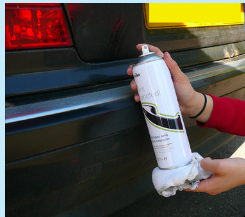
WILKINSONS BUMPER AND TRIM RESTORER 500ML £2.25

By far the most expensive I tested, but it ranked in the middle of the two others when it came to performance. This spray produced a disappointingly low shine when buffed up.