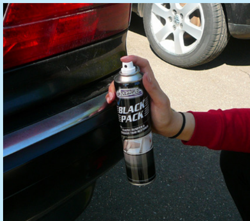
BLACK PACK 300ML £0.99 FROM QD STORES

You know the stuff in cans that brings your dull bumpers to life and can also transform your miserable plastic interior? That stuff. Well, I decided to tackle the dirty back bumper on Free Car Mag's ancient BMW 7 Series that we call Shed 7. So this was a very tough test.