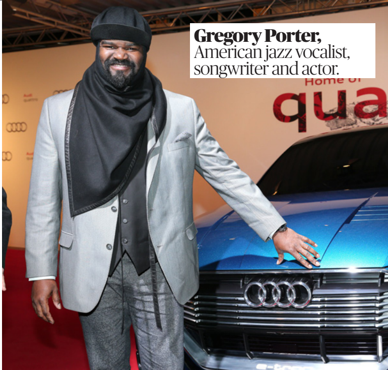
Gregory Porter, American jazz vocalist, songwriter and actor.