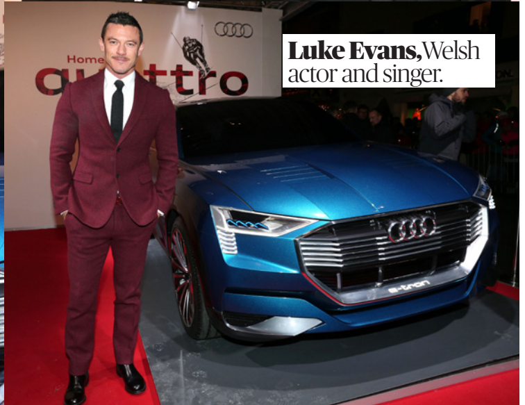
Luke Evans, Welsh actor and singer.