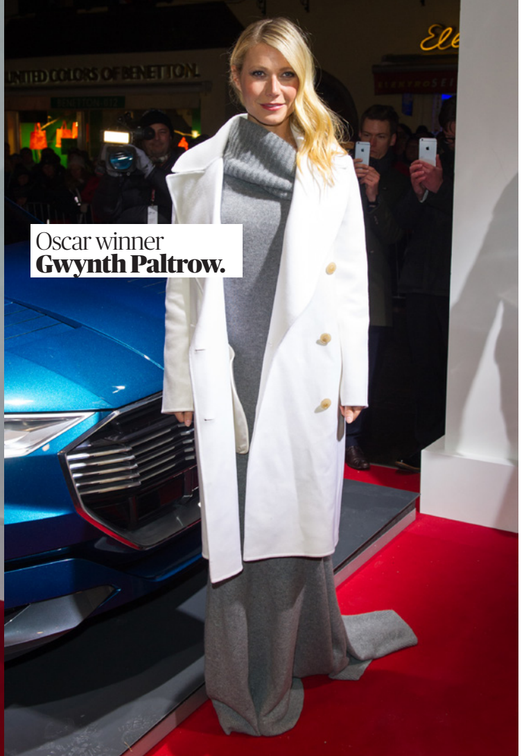
Oscar winner Gwyneth Paltrow.