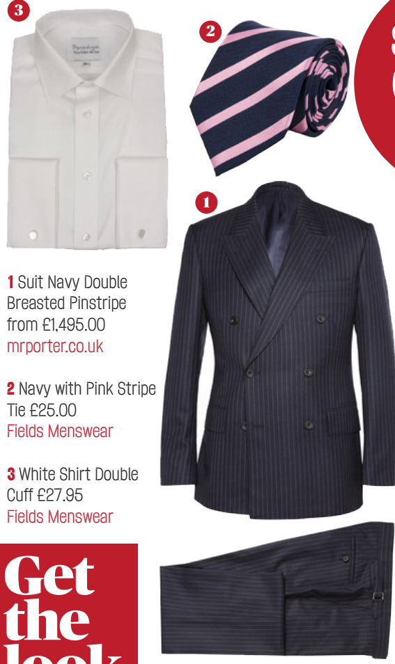
1 Suit Navy Double Breasted Pinstripe from £1,495.00 mrporter.co.uk