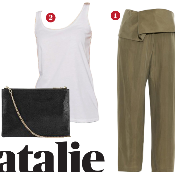
3 Whistles Clutch £85.00 Very Exclusive