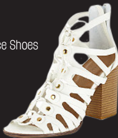
Gladiator White Lace Shoes £29.99 New Look